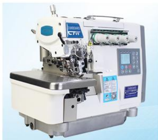
automatic welting machine