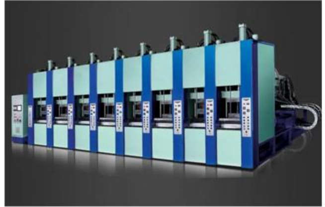
EVA injection machine