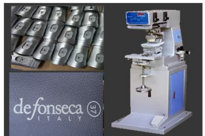
Pad Printing Machine