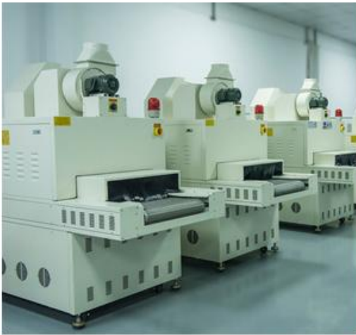
UV light machine